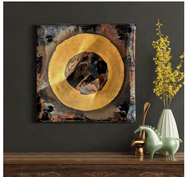
Palladium Glaze ( a shiny reflective glaze) with Gold Leaf applique and Black standoffs