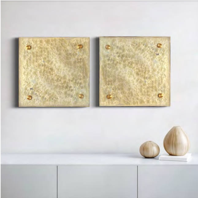
Ivory with Gold