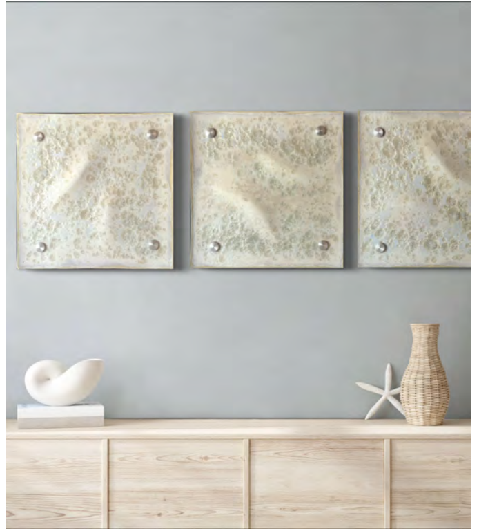
Pearl with Silver