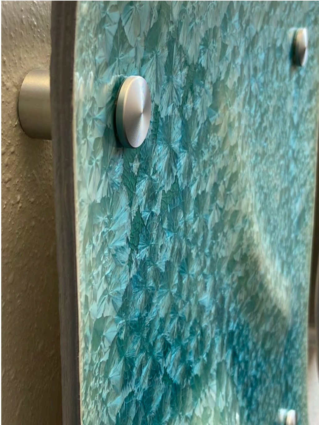
Aqua Crystalline Glaze

High Fired Ceramics with Specialty Glazes