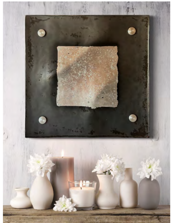
Deep Gray glaze with Silver Leaf applique and Silver Standoffs.