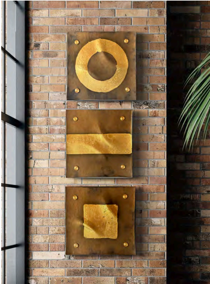
Copper/Gold satin glaze with Gold Leaf applique & Gold standoffs

Each Slab is hand formed with the distinctive "wave". After firing, metallic leaf is applied. Each measure 16"h x 16"w x 1" and come with a choice of standoff colors: Soft gold, silver, black or bronze.