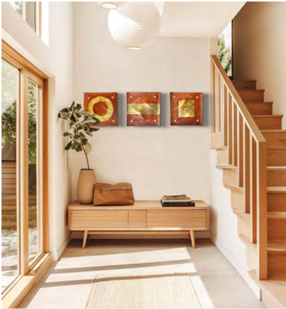
Copper Glaze with Gold