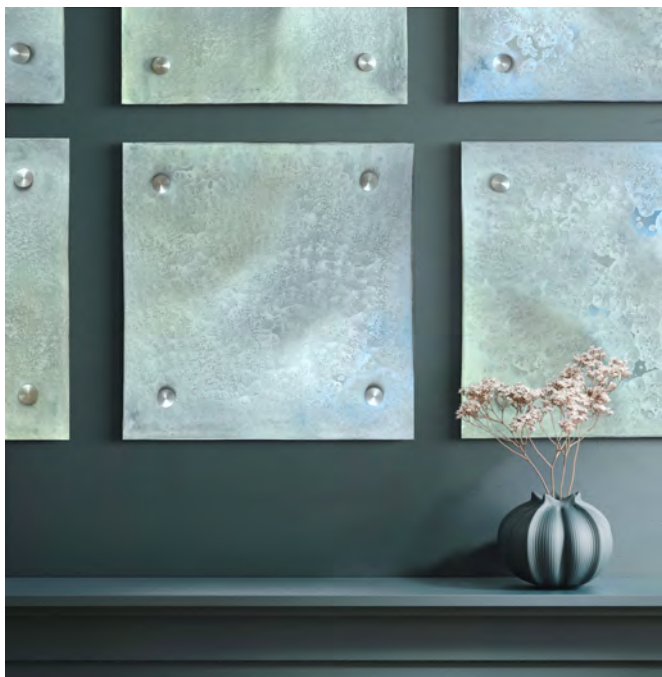
"Mist" Soft Gray with Crystalline Glaze